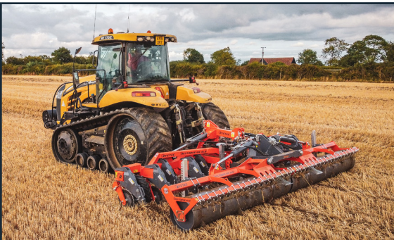
Restorer 6m ALD with rear packer