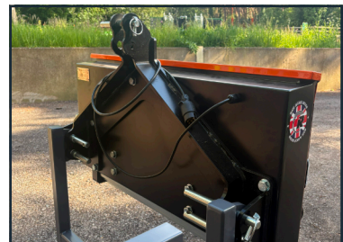
Workbox Mini Cat 1 & 2 Linkage which can be swapped for Cat 0. Bolster mount available at extra cost

For more information contact Ryetec Industrial Equipment Limited Mill House, A64 East Knapton, Malton, North Yorkshire YO17 8JA T: 01944 728 186 | www.ryetec.co.uk | f /ryetec