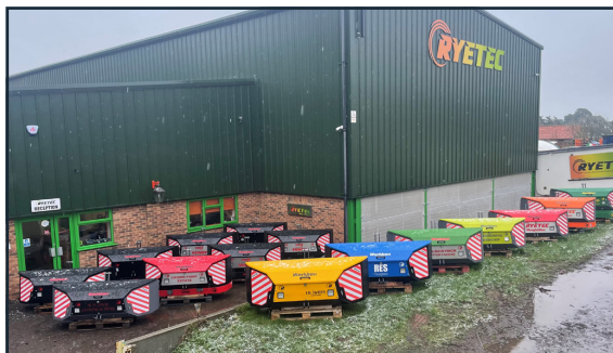
Weightboxes & Workboxes with various options/colours

For more information contact Rytec Industrial Equipment Limited Mill House, A64 East Knapton, Malton, North Yorkshire YO17 8JA T: 01944 728 186 | www.ryetec.co.uk | f /ryetec