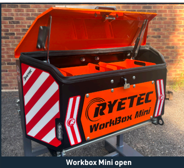
Workbox Mini open