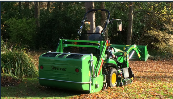
Mini Flail Collector - high performance flail mower and scarifier collector