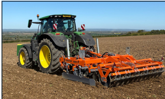
Riot 3 - 3 in 1 one pass cultivation tool producing a fantastic seed bed