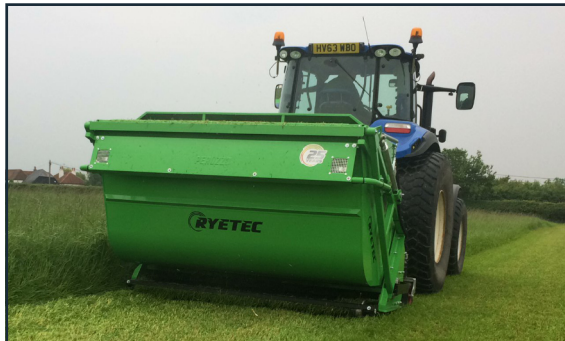
Contractor Flail Collector - heavy duty flail mower collector