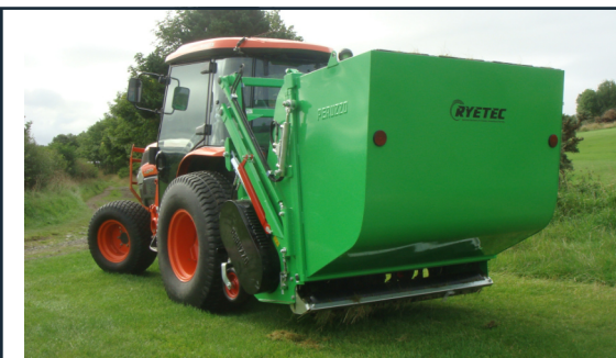
Professional Flail Collector - high performance flail mower and scarifier collector