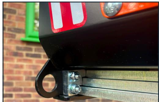
Workbox Mini Belly Plates for additional weight while maintaining tool storage in the box