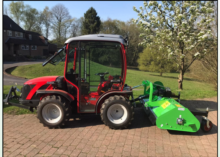
P1800 front mounted