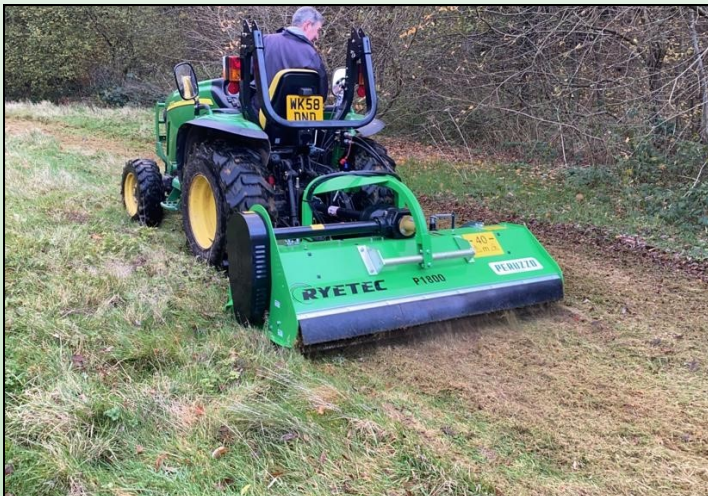
P1800 in action