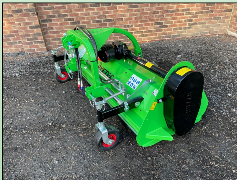
P1800 with front castors