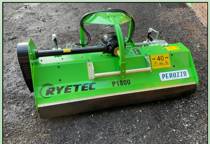
P1800 with hydraulic offset

The Professional range offers a robust frame and rotor combination with a range of flail options. They can operate in most conditions, both long and overgrown grass and light scrub (up to 35mm thick) to fine finish lawns leaving a smart rolled finish. The heavy duty transmission with oil immersed cross shaft and remote greasing points allows for easy maintenance and a long trouble free working life. The optional front mounted castor wheels give accurate cutting height control and reduce the possibility of scalping. The overrun clutch PTO shaft, also optional, protects both mower and tractor when the tractor is fitted with independent PTO drive.