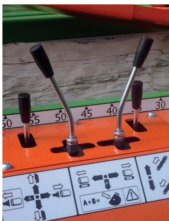
Central operator station with convenient two handed joystick controls