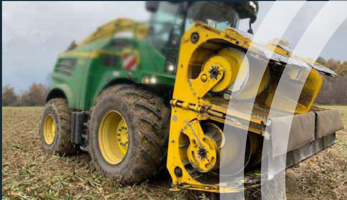
John Deere Foldbar ready for transport