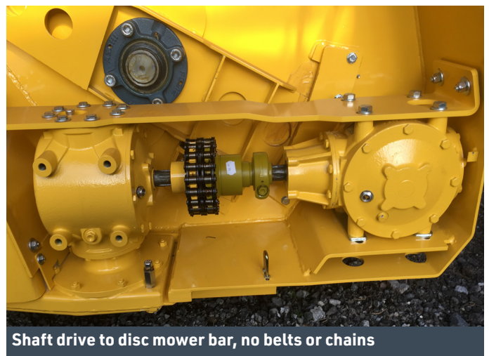
Shaft drive to disc mower bar, no belts or chains

For more information contact Ryetec Industrial Equipment Limited Mill House, A64 East Knappton, Malton, North Yorkshire YO17 8JA T: 01944 728 186 | www.ryetec.co.uk | f /ryetec