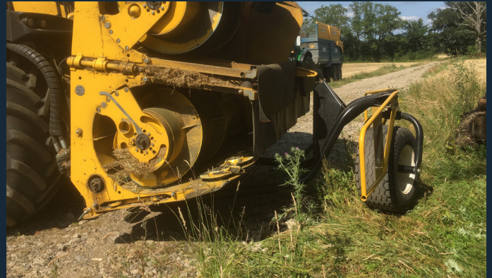
Foldbar with Kemper wheel fitted for road transport