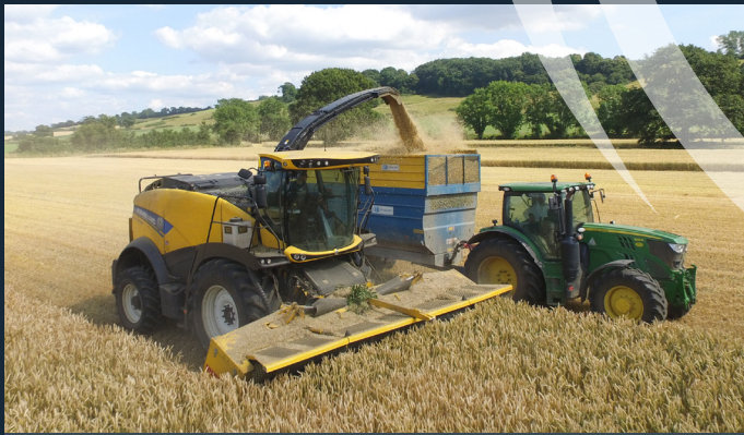
6m Foldbar in action on a New Holland