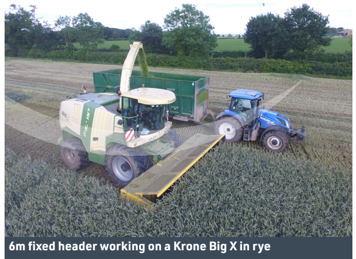
6m fixed header working on a Krone Big X in rye