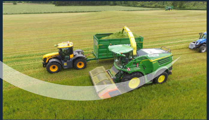
Also available the Ryetec 4m Quickcut 4010