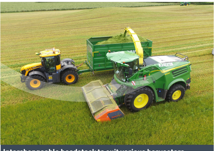
Interchangeable headstock to suit various harvesters