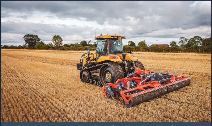
Ryetec's Restorer range of low disturbance sub soilers