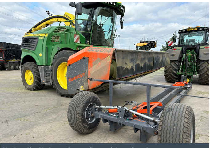
Hydraulically lowering trailer, with optional rear steer