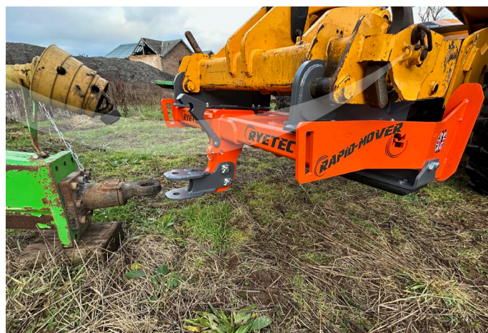
Fold out clevis hitch to move trailed implements with ease