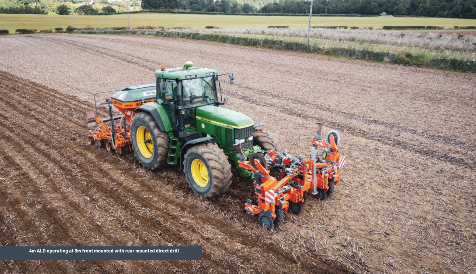
4m ALD operating at 3m front mounted with rear mounted direct drill