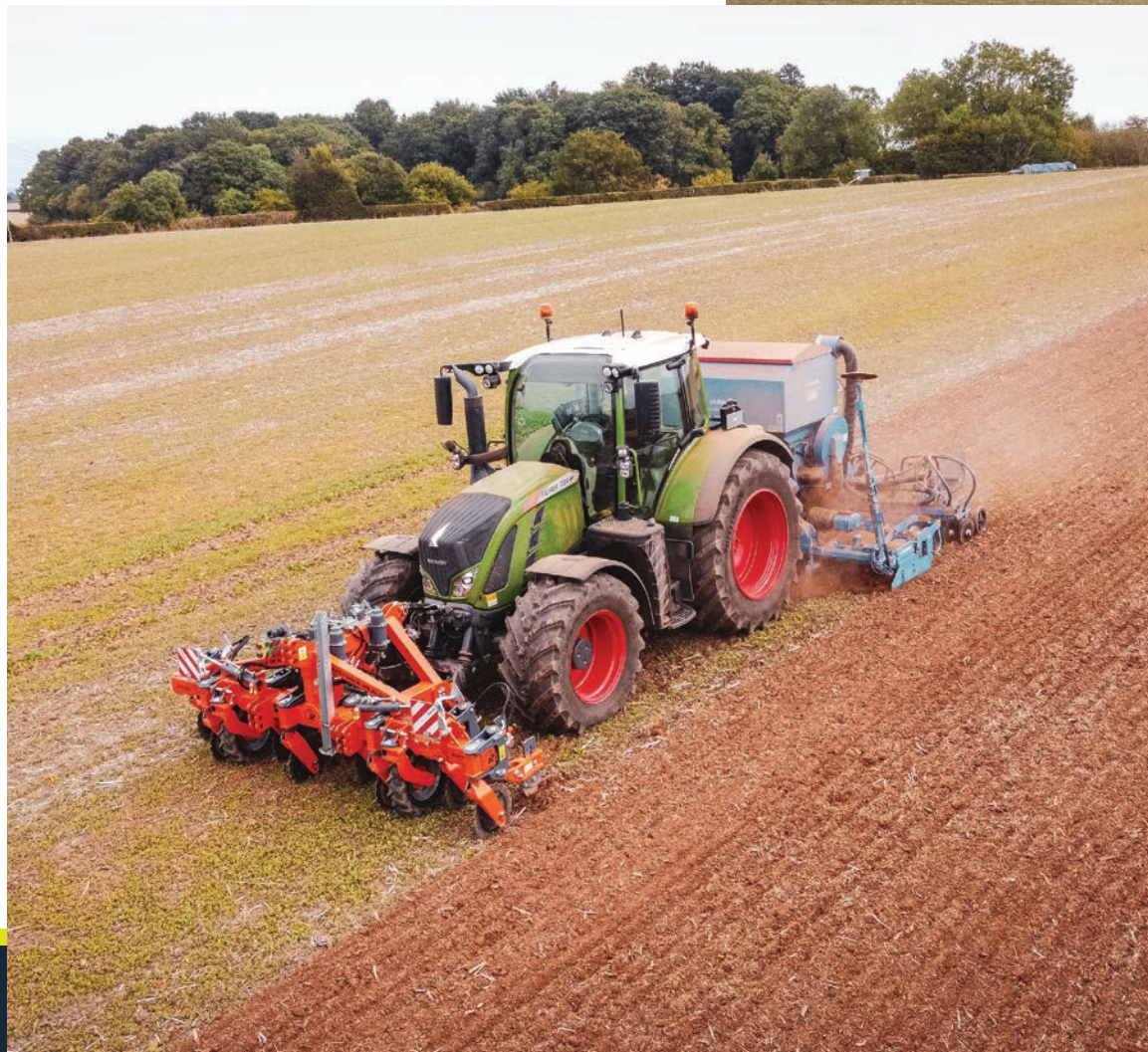
Front mounted 4m running with combi drill