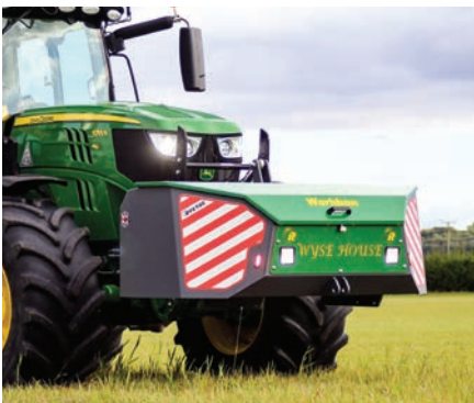
Front mounted box with LED hazard and worklights as standard

RyeteC's WeightBox and WorkBox have been designed to combine an effective counterweight with secure and easy to access tool storage in a full-width large capacity toolbox. They are fully customisable in a range of colours to match your tractor with your choice of logo to the front.