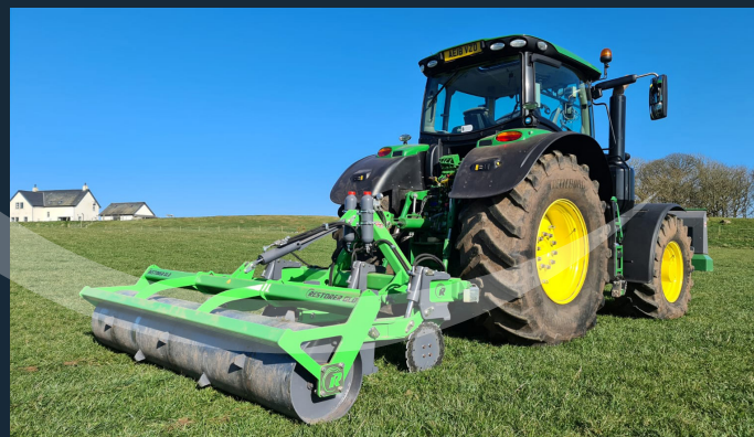
Restorer 3m GLD grassland low disturbance sub soiler