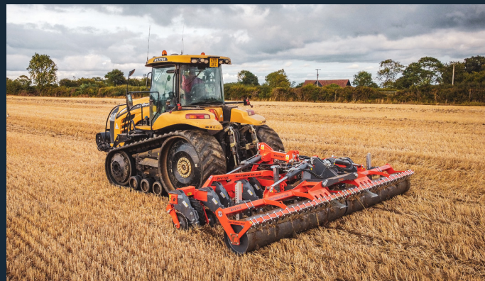
Restorer 6m ALD with rear packer