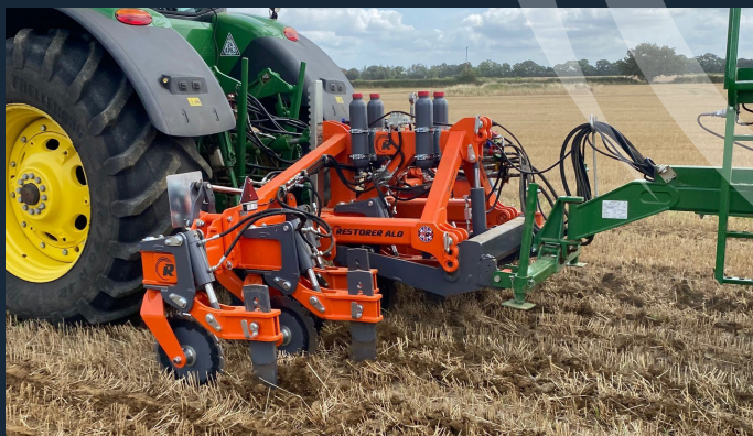
Restorer 4m ALD with hydraulic linkage working as a toolbar