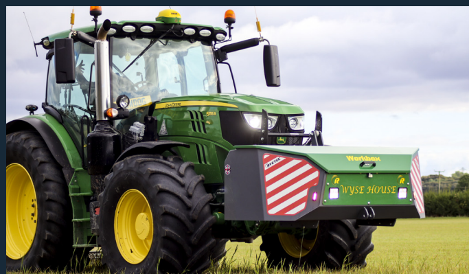
Workbox in action

For more information contact Ryetec Industrial Equipment Limited Mill House, A64 East Knappton, Malton, North Yorkshire YO17 8JA T: 01944 728 186 | www.ryetec.co.uk | f /ryetec