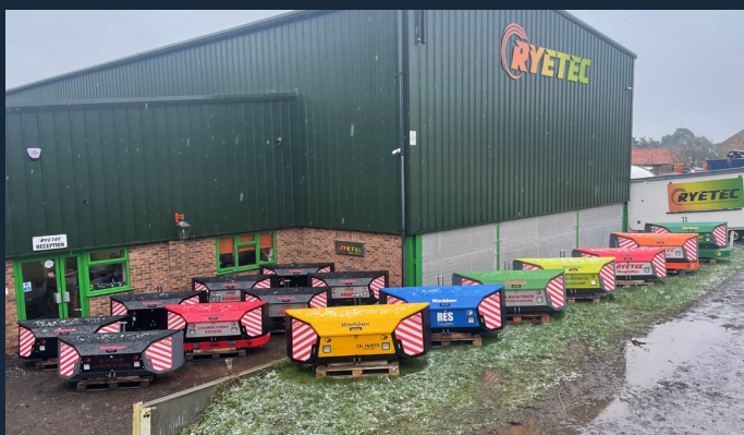
Weightbox's & Workbox's with various options/colours