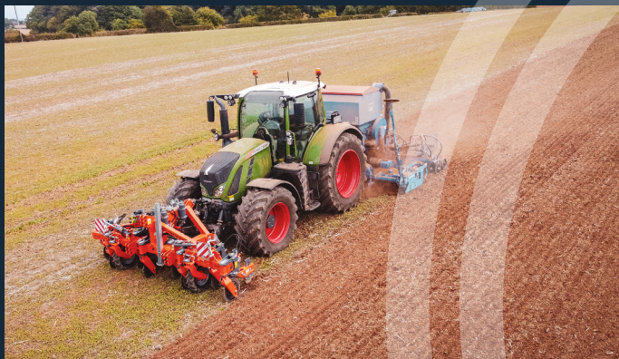
Restorer 4m ALD running front mounted with combi drill