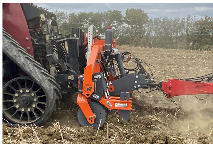
HD pivoting discs & legs

For more information contact Ryetec Industrial Equipment Limited Mill House, A64 East Knappton, Malton, North Yorkshire YO17 8JA T: 01944 728 186 | www.ryetec.co.uk | f /ryetec