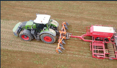
6m Restorer ALD Toolbar