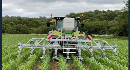
Zocon Greenseeder Maize Into Row Seeder