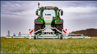
Zocon Greenkeeper Grass Overseeder