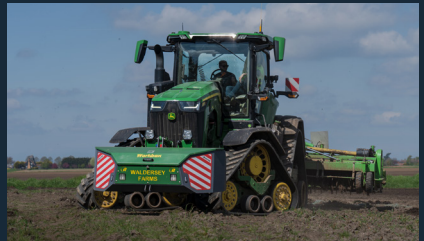
Workbox in action

For more information contact Ryetec Industrial Equipment Limited