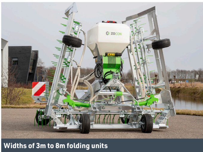
Widths of 3m to 8m folding units