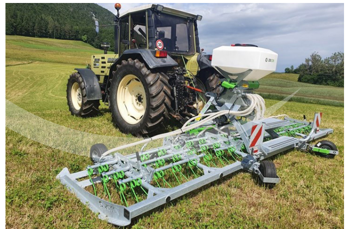
Great for cover crops, grass and catch crops