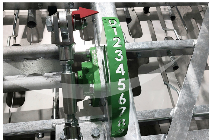
Hydraulic tine pressure adjustment across the full machine