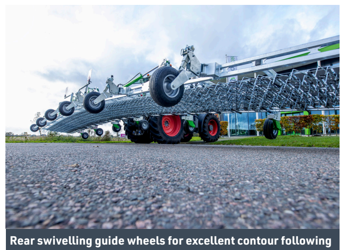
Rear swivelling guide wheels for excellent contour following

For more information contact Ryetec Industrial Equipment Limited Mill House, A64 East Knapton, Malton, North Yorkshire YO17 8JA T: 01944 728 186 | www.ryetec.co.uk | f /ryetec