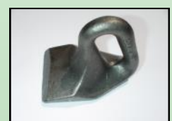
Type B1 SL BOM-60