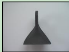
Type 4 (T4) MP 08-21-89