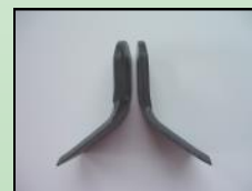
Type 15 (T15) MP and SL 08-21-13