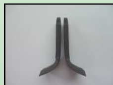
Type 13 (T13) MP 08-21-86